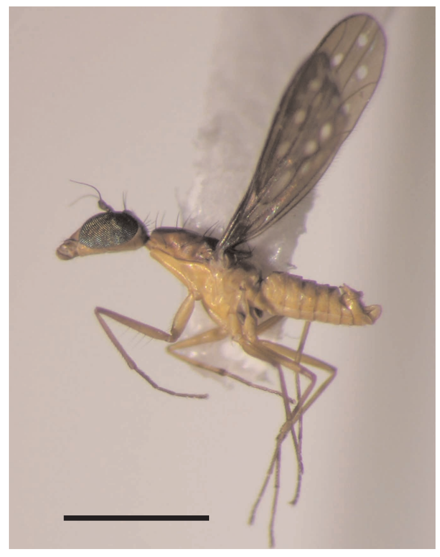
Fig. 1. Dolichocephala ciwatikina, n. sp., habitus.Scale bar = 1.0 mm.

Description. Male. Head. Slender, tapered ventrally. Face light brown lacking greyish pruinescence. Frons light brown between inner margins of eye and posterior ocelli. Vertex dark brown with gray-ish pruinescence; occiput light brown, concolorous with face. Ocellar triangle with pair of stout upturned bristles.