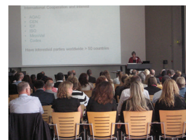
AOAC Europe- NMKL - NordVal - Symposium 2012