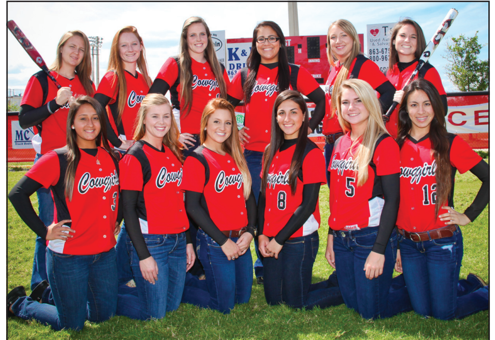
The 2013 LaBelle Cowgirl Varsity soft ball team.