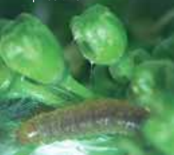
The larva and its damage, which should be averted