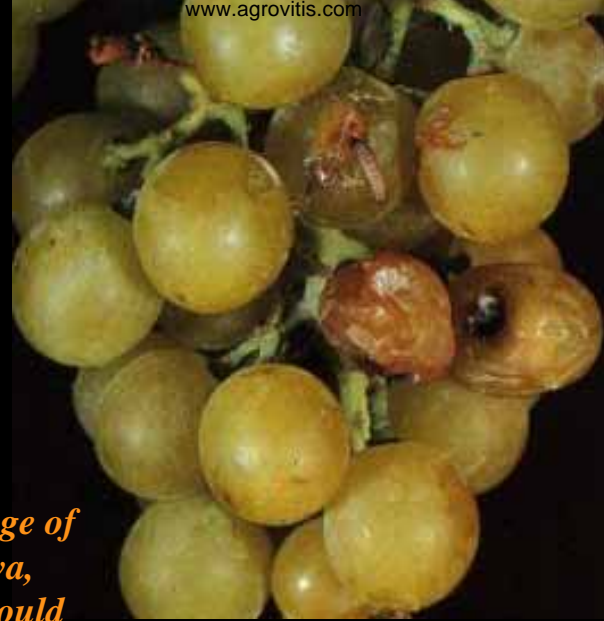
The damage of the larva, which should be averted