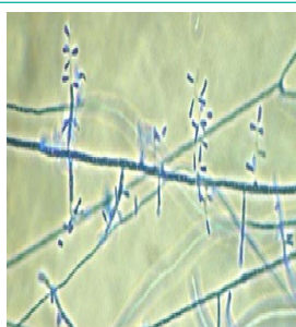
Figure 1: Keratinophilic fungi.

The pathogen invades the uppermost, non-living, keratinized layer of the skin namely the stratum corneum, produces exo-enzyme keratinase and induces inflammatory reaction at the site of infection [23-26]. The customary signs of inflammatory reactions such as redness (ruber), swelling (induration), are seen at the infection site. Inflammation causes the pathogen to move away from the site of infection and take residence at a new site. This movement of the organism away from the infection site produces the classical ringed lesion [27].