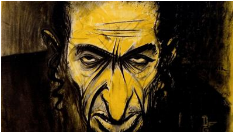
"The Eternal or Wandering Jew," another Nazi propaganda poster, is part of "State of Deception: The Power of Nazi Propaganda," a traveling exhibit opening Sunday, Feb. 11, at the Holocaust Documentation and Education Center in Dania Beach.