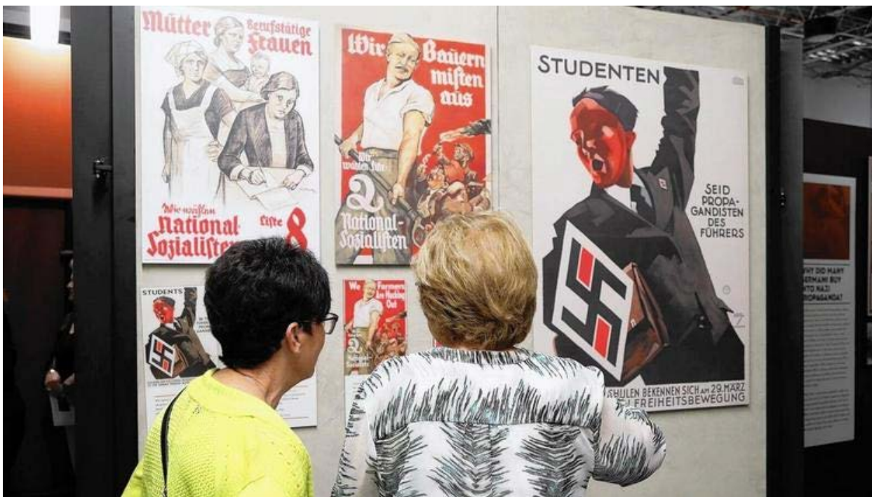
Visitors view the State of Deception: The Power of Nazi Propaganda exhibit at the Holocaust Documentation & Education Center in Dania Beach.