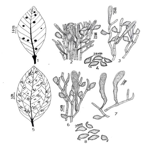
Fig.2: Hand drawings of Septobasidium sterilis sp.nov on the sacle insect (Aspidiotus hartii) on the living leaf of Atalantia racemosa (1) and living leaf of Cinnamomum zeylanicum (5); Mycelium with appendages and stalked probasidia (2&6), Magnified mycelium with appendages and stalked probasidia (3&7), Stalked probasidia (4&8).

amphigenus, plurimum hypophyllus, compactus, usque 2-5 mm in diametro, chocolate, basilaris subiculum et hypha columen; hypha septatus et destitutus, directus et substratum, ramus alternus ad latus angulus, dense reticulates et formatus solidus mycelialis teges, cella 63-85 x 7-8 \mu m ; hymenium mycelialis appendiculatus et numerosi pedunculatus probasidia; mycelialis appendicula