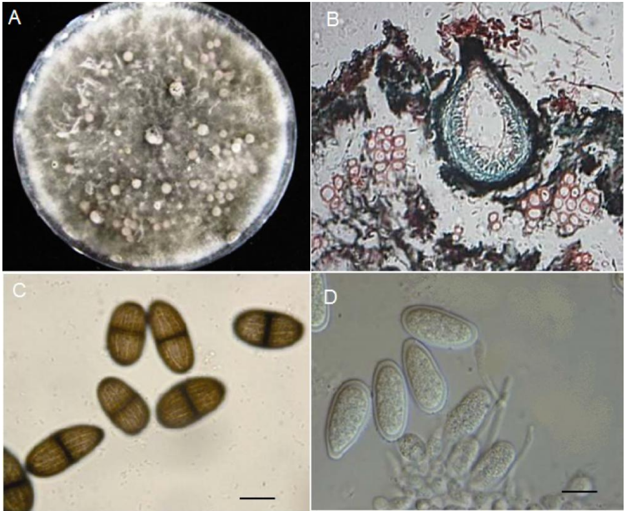
Fig.1. Lasiodiplodia theobromae . A. Growth on potato dextrose agar(PDA)after 10 days. B. Longitudinal section of infected shoot of grapevine showing pycnidium with 2-celled dark pycnidiospores C. Conidia mature dark brown with one septum D . Paraphyses cylindrical, aseptate, hyaline. Conidia produced initially hyaline and aseptate, subovoid to ellipsoid-ovoid bar= 10µm.

,including mango in Oman and Pakistan (Adawi et al. ,2003 ;Khanzada et al. ,2004), apricot and peaches in China(Li et al. , 1995).