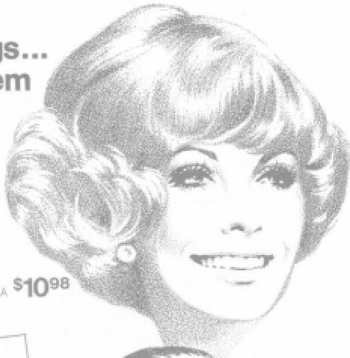
PAMELA $10 98