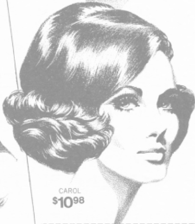
CAROL $10 98