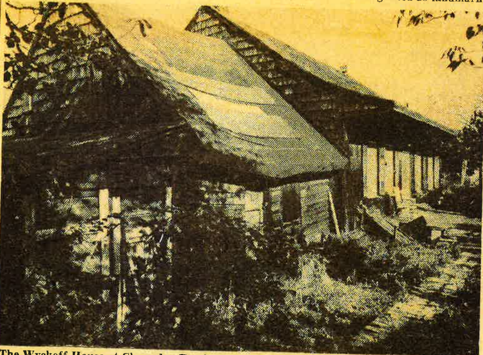
The Wyckoff House at Clarendon Road and Ralph Avenue in Brooklyn may be city's oldest