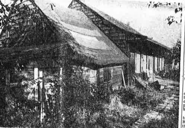
The Wyckoff House at Clarendon Road and Ralph Avenue in Brooklyn may be city's oldest