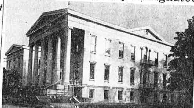
Six buildings of Sailors Snug Harbor in Staten Island have been designated as landmarks

The trustees' policy from the beginning was to lease only small parcels for 21 years at a time. The commission is moving on