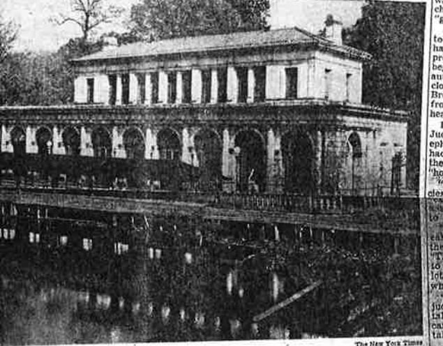
Also designated by Landmarks Preservation Commission was Prospect Park Boat House