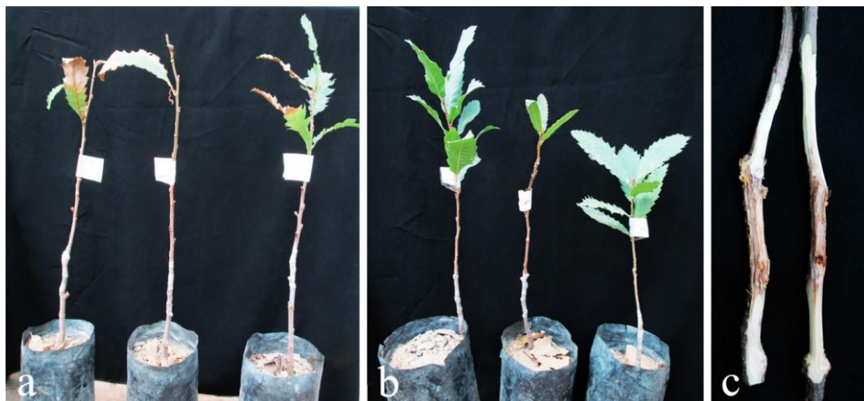
Fig. 3. Disease symptoms caused by Phaeoacremonium tuscanicum on oak seedling in greenhouse conditions. a. inoculated plant after 3 months; b. negative control; c. necrotic lesion expanded upwards and downwards of the inoculated point on the stem internodes.