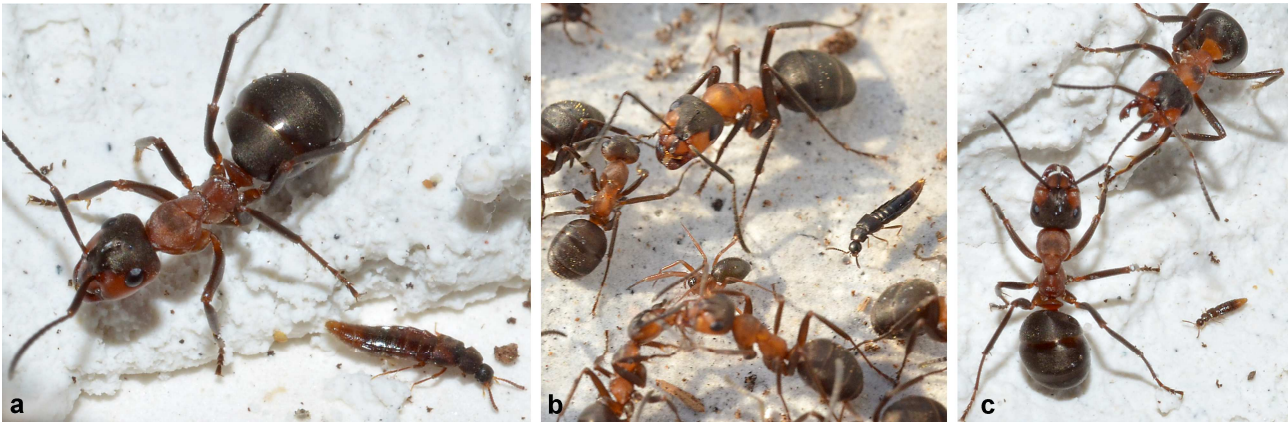
Fig. 1: Overview of the three myrmecophilous beetles with their red wood ant host: (a) Thiasophila angulata with Formica polyctena , (b) Lyprocorrhe anceps with Formica rufa , and (c) Amidobia talpa with Formica polyctena . The myrmecophilous spider Thyreosthenius biovatus can also be observed in the centre of b.

glands and chemical mimicry. Such adaptations might lower ant aggression and enable the myrmecophiles to successfully integrate in ant colonies. What is more, they are treated as true colony members as they are fed, groomed and transported by the ants (HÖLLDOBLER & WILSON 1990, AKINO 2008, BLOMQUIST & BAGNÈRES 2010, KRONAUER & PIERCE 2011). However, some myrmecophiles are seemingly unspecialized (synechthrans, i.e., indifferently tolerated guests, and synoeketes, i.e., hostile persecuted guests, sensu WASMANN 1894): They are very similar to their non-myrmecophilous counterparts and lack the aforementioned variety of adaptations (DONISTHORPE 1927, HÖLLDOBLER & WILSON 1990). These myrmecophiles might be exposed to frequent ant aggression (DONISTHORPE 1927, PARMENTIER & al. 2015a), which can lead to an elevated stress response in the myrmecophiles, injuries and ultimately death (HÖLLDOBLER & al. 1981, NELSON & JACKSON 2009; T. Parmentier, W. Dekoninck & T. Wenseleers, unpubl.).