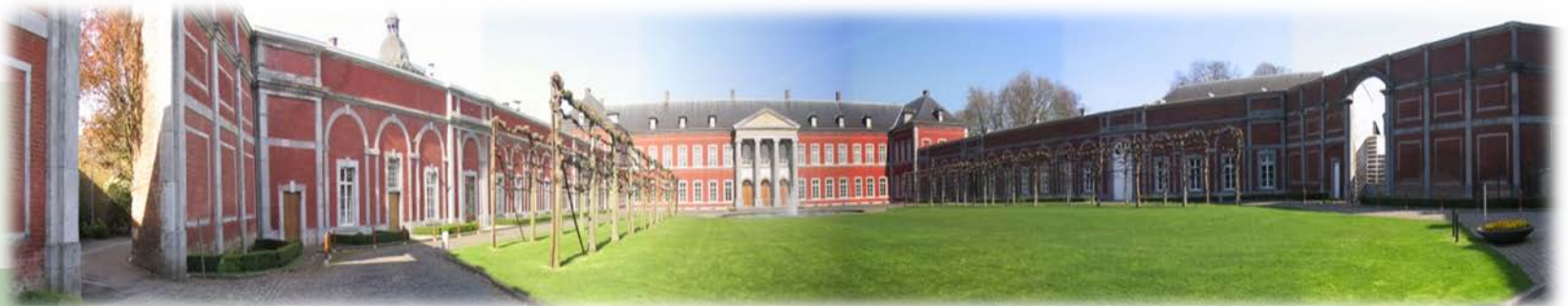
Gembloux Agro-Bio Tech site, ValBiom