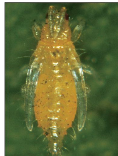
6 WFT pupa