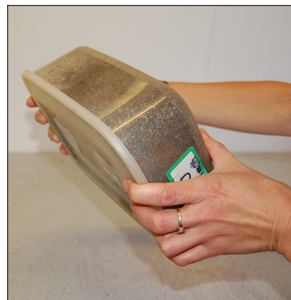
13 Rotating rearing box to mix in food source and water