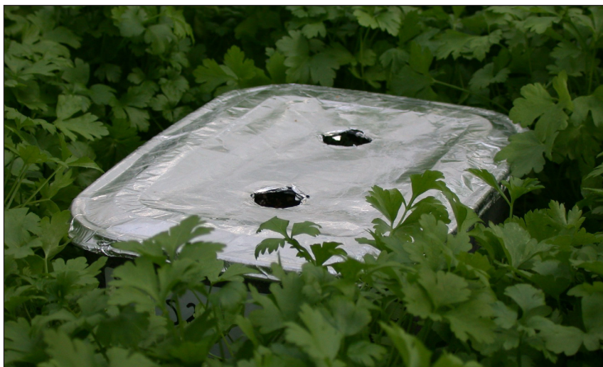
15 Rearing-release box in parsley

used, but care should be taken not to allow the substrate to get too wet from additional overhead watering.