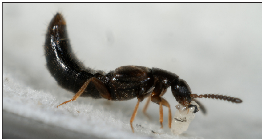
7 Atheta coriaria is a good predator of fly larvae, shown here eating a cabbage root fly larva