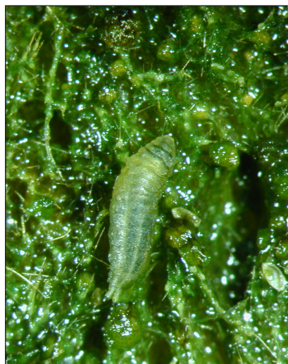
5 Shore fly larva feeding on algae

Growers of ornamentals and herbs have experienced variable results after releasing Atheta at the rates recommended by suppliers (up to 10 per m 2 ) for control of sciarid and shore flies. Our research results showed that much higher release rates may be needed. Sciarid fly females can lay up to 200 eggs each in their lifetime (Figure 9) and shore fly females can lay up to 300 each. On potted parsley infested with relatively low numbers of sciarid fly eggs (five eggs per pot), five Atheta per pot were needed to give 85% control of the pest over the 5-week production period. This rate is equivalent to 500 Atheta per m 2 , which would be too expensive, if the predators are bought from a commercial supplier. Rearing the predators on the nursery offers growers a low-cost method for using high release rates and for maintaining an Atheta population on the nursery.