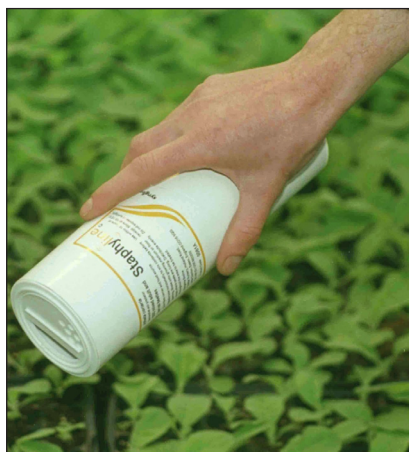
8 Releasing Atheta from a commercial pack