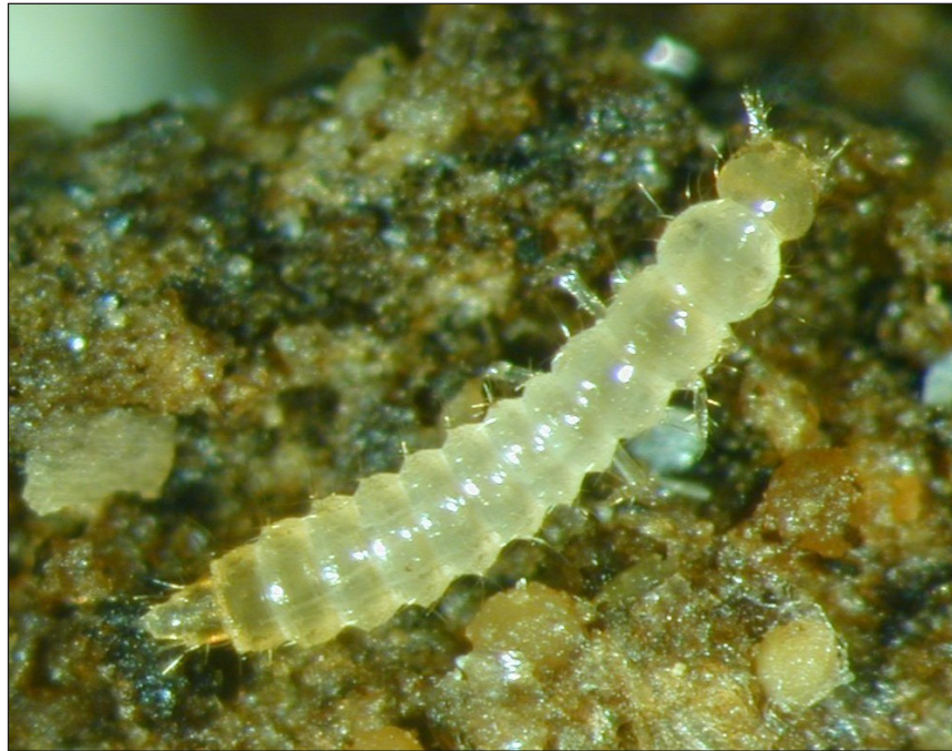
2 Young Atheta coriaria larva with white body segments

The adult beetles are small (3-4 mm long), dark brown and shiny, with an upturned abdomen (Figure 1). They are very active and can both crawl and fly. Females lay their eggs between soil particles and the eggs hatch into the first stage larvae, which are small and milky white (Figure 2). There are three larval stages, which become slightly darker and longer as they grow. The final, third stage larvae are brownish yellow and about 3-4 mm long (Figure 3). All larval stages are predatory and can run rapidly but cannot fly. When fully fed, the third stage larvae build pupation chambers out of soil or compost particles held together with strands of silk. Pupal chambers are not visible in compost. Pupae develop inside these chambers and do not feed or move until they emerge as new adults.