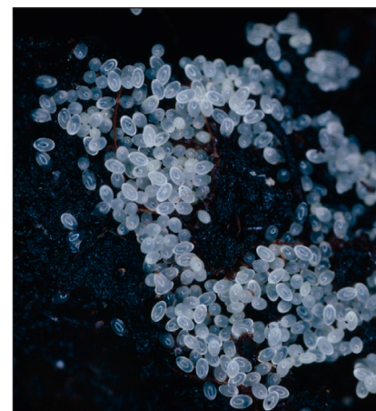
9 Sciarid fly eggs are laid in clumps, on or just under the growing medium