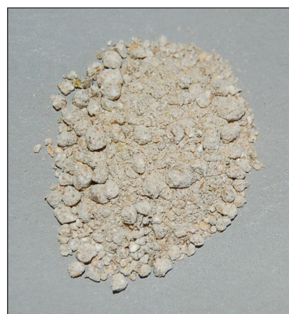
12 Turkey pellets after grinding in food processor