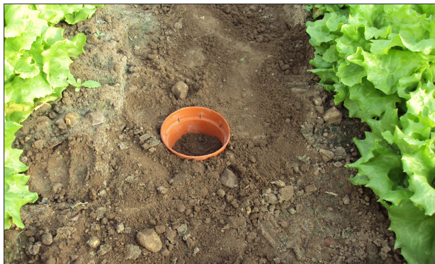
16 Atheta 'bait pot' sunk in soil in lettuce crop

The Atheta rearing or rearing-release system was not fully validated on a large scale on commercial nurseries. However, several growers of protected ornamentals and herbs have experimented with their own Atheta rearing or rearing-release systems and report reductions in numbers of both sciarid and shore flies. One grower of herbs and ornamentals reported excellent control of previously high populations of sciarid flies in a propagation house, when Atheta were reared in sealed boxes and then distributed around the glasshouse on repeated occasions over several months. Two growers of ornamental bedding and pot plants