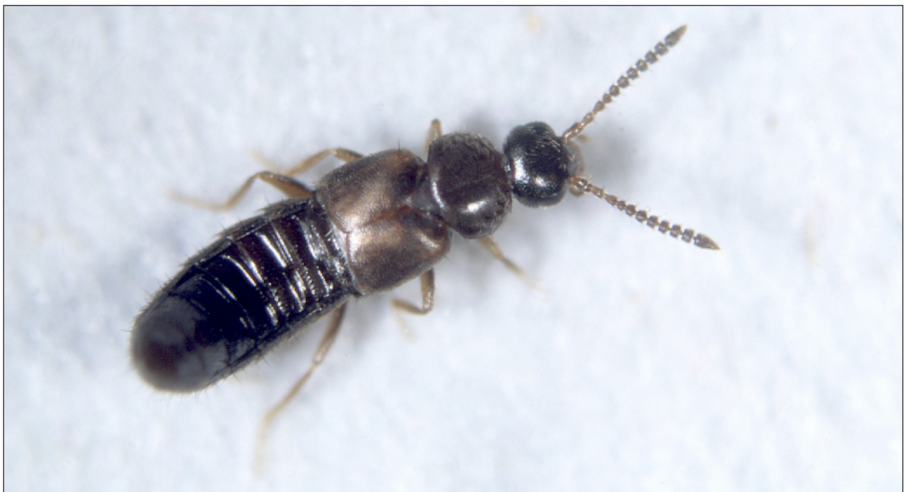
1 Atheta coriaria adult