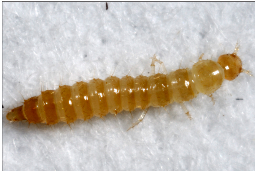
3 Older Atheta coriaria larva with brown body segments