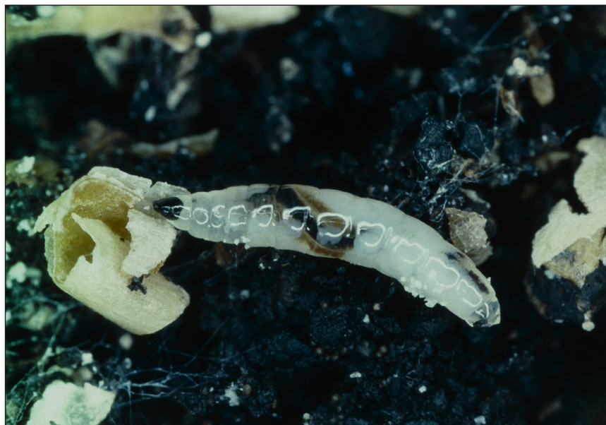
4 Sciariid fly larvae live in compost