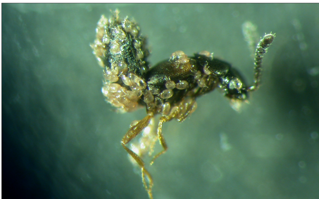
14 A potential problem: Atheta adult infested with mites

• Shade boxes from direct sunlight (e.g. cover lids with foil) if Atheta is being reared in a glasshouse, otherwise beetles may suffer from overheating and algae will grow on the substrate surface.