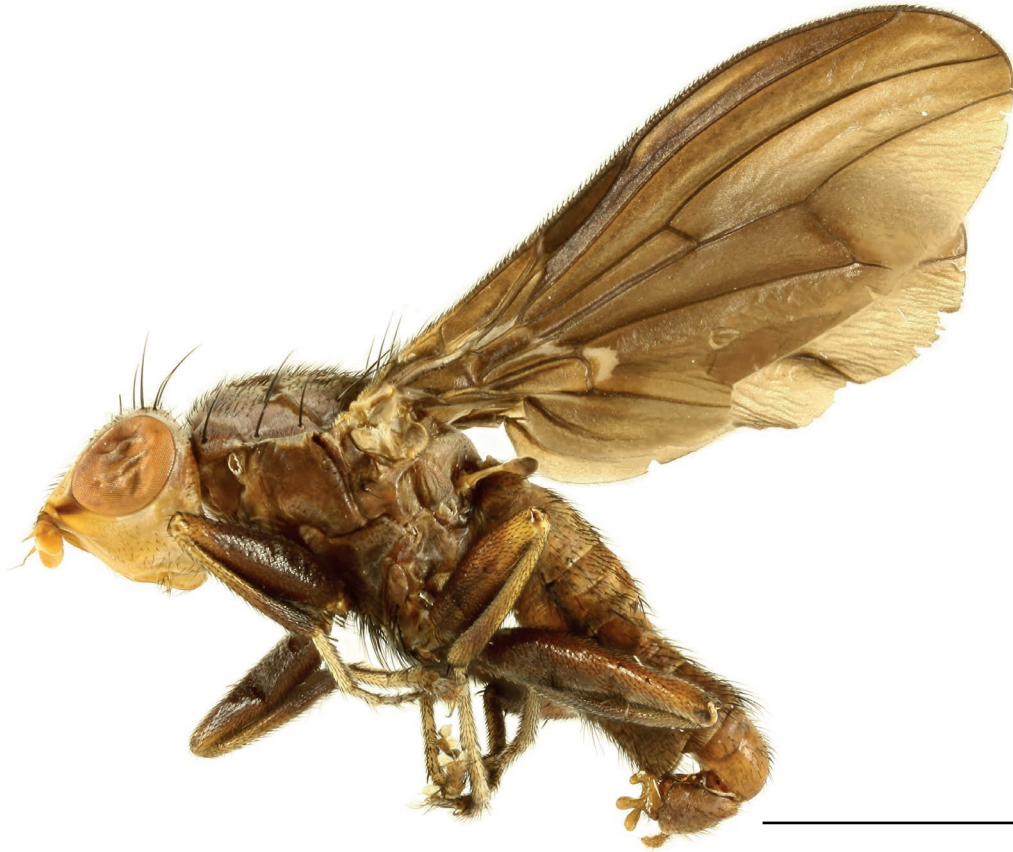
FIG. 2. — Pelidnoptera nigripennis (Fabricius, 1794), male habitus, characteristic posterior part of the bifurcate surstyli has been manually extended. Scale bar: 0.5 cm.

Tribe Tetanocerini Schiner, 1862 Genus Coremacera Rondani, 1856