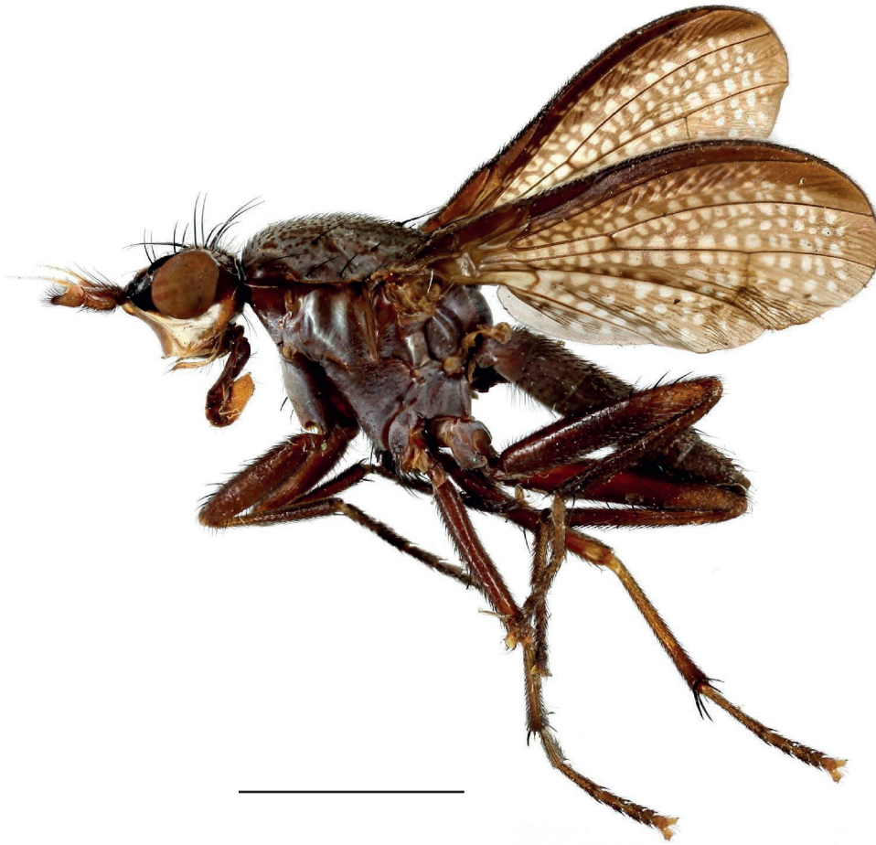
FIG. 3. — Coremacera marginata (Fabricius, 1775), male habitus. Scale bar: 0.5 cm.