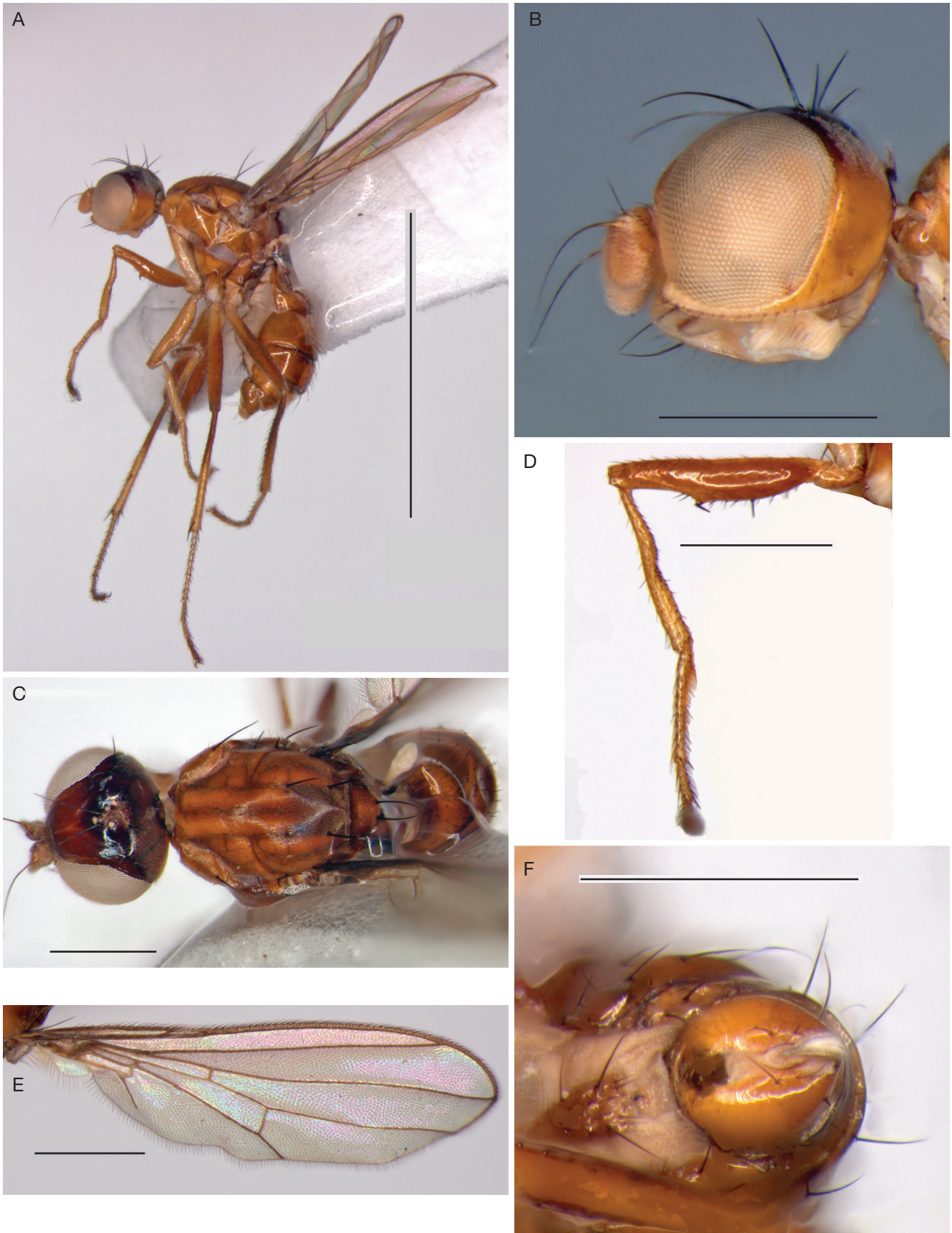
FIG. 2. — Palaeosepsioides mitarakensis Silva, n. sp., male holotype: A , habitus, lateral view; B , head, lateral view; C , habitus, dorsal view; D , left fore leg, posterior view; E , wing; F , posterior part of abdomen, ventral view. Scale bars: 0,5 mm, except Fig. 2A, 2,5 mm.