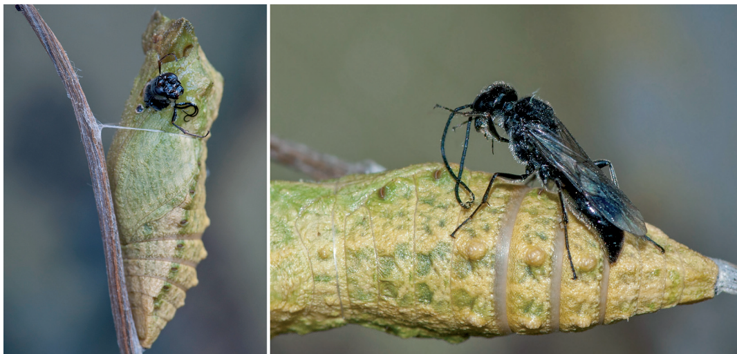
Fig. 5. Pseudogonalos hahnii emerging from Papilio machaon pupa. 13 June 2015. Kirov region, Russia.

1). All these four subfamilies are koinobiont endoparasitoids (Gauld & Bolton 1988). Species that parasitize lepidopteran caterpillars from the endoparasitic koinobiont subfamilies Campopleginae and Metopiinae are other possible primary hosts. On the contrary, species from ectoparasitic or idiobiont ichneumonid subfamilies parasitizing Lepidoptera are not likely to act as primary hosts (Schnee 2011). Ctenopelmatine ichneumonids could serve as possible primary hosts via sawfly larva as the members of the subfamily are larval koinobiont endoparasitoids of sawflies (Gauld & Bolton 1988, Schnee 2011). Another possible primary host group for P. hahnii are tachinid flies that attack lepidopteran (or even symphytan) larvae (Weinstein & Austin 1991, Schnee 2011) as several trigonalid wasp species have indeed been reared from tachinid puparia (Li et al. 2012, Smith et al. 2012). There are some erroneous or at least highly dubious old records that P. hahnii could parasitize vespine wasps (Vespidae) or their parasitoids. There is also one report of P. hahnii parasitizing the neotropical paper wasp Polistes lanio (Fabricius) that Carmean and Kimsey (1998) consider clearly improbable.