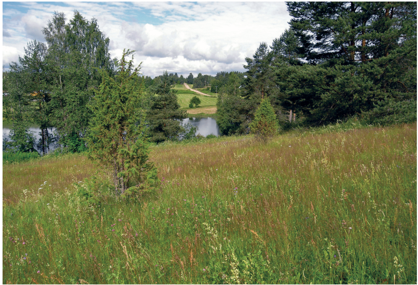
Fig. 3. Habitat of Pseudogonalos hahnii in Finland (Parikkala, Melkonieni).

BOLD database or GenBank, so comparison with other specimens was not possible.