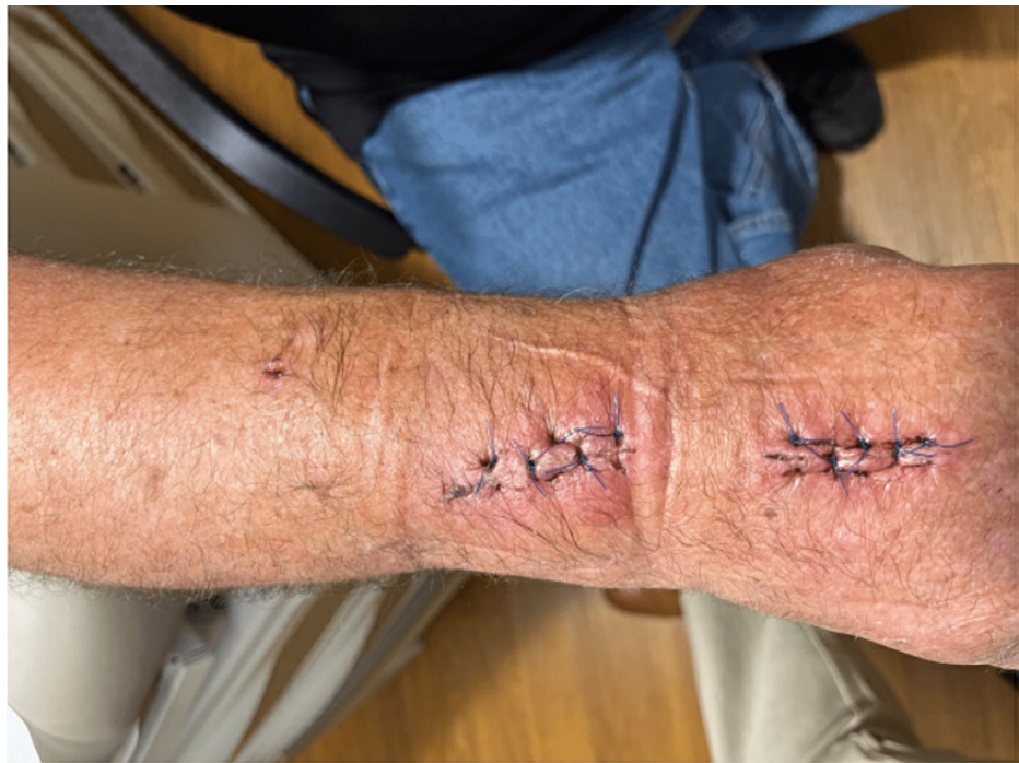
FIGURE 4: Wrist appearance on postoperative day eight