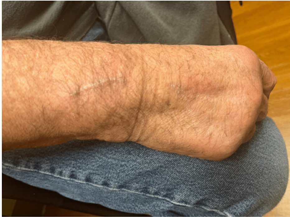
FIGURE 5: Wrist appearance on postoperative day 59