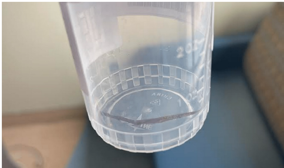
FIGURE 3: Foreign body removed at the time of surgery

He was initially treated with vancomycin, piperacillin-tazobactam, and clindamycin. The following day, he still had significant pain and a diminished range of motion. Aspiration of the wrist yielded purulent appearing fluid. He underwent operative exploration later that day. No purulence was noted at the time of surgery, but there was extensive inflammation and a wooden foreign body (approximately 2mm x 3mm x 30mm, Figure 3) was removed from the soft tissues; following removal, he underwent pulsatile irrigation. Intraoperative cultures were not obtained. No organisms were seen on the pre-operative aspiration Gram stain. Due to ongoing symptoms, he underwent a second irrigation two days after the first; again no purulence was seen. As bacterial cultures were negative, he was dismissed on an empiric antibacterial regimen of amoxicillin-clavulanate and doxycycline for presumptive infectious tenosynovitis.