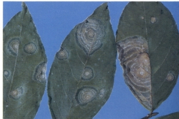
Fig. 1. Foliar symptoms of Cristulariella leaf spot on Lagerstroemia indica (crepe myrtle) showing typical concentric ring pattern and rapid expansion of leaf spots.

SYMPTOMS: Susceptible foliage infected by Cristulariella displays symptoms quickly. During periods of cool moist weather entire leaves may become blighted. Initial symptoms vary from host to host, but generally, watersoaked, greenish-gray, circular or irregularly-shaped leaf spots develop, which may be accompanied by a chlorotic halo. Spots eventually produce alternating concentric bands of lighter and darker tissue, giving these lesions their common zonate or target appearance (Fig. 1). Depending on the host and weather conditions, lesions may coalesce and give a scorched appearance. Rapid tissue death is due to a combination of toxic and enzymatic processes. Cristulariella produces oxalic acid in toxic amounts and the pectic enzymes that degrade cell walls are synergized by the acid (Sinclair et al. 1987).