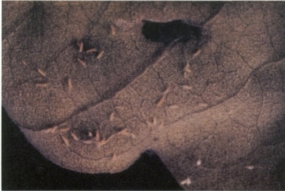
Fig. 2. Close-up of pyramidal-shaped propagules on a blighted leaf of rites sp.

PATHOGEN: Cristulariella sporulates readily on infected tissue and can be observed easily with a hand lens or dissecting microscope. The conidia or propagules produced by the fungus are characteristically pyramidal or cone-shaped and are off-white in color (Fig. 2). Sporulation may occur on both sides of infected foliage. Propagule production varies with the host, temperature, and relative humidity. Cool, wet weather during mid- and late summer is optimum for disease development. Sclerotium cinnamomi Sawada, the sclerotial stage of Cristulariella , may also develop on diseased plant tissue. These sclerotia appear as black, crusty, irregularly-shaped structures approximately 2-5 mm in diameter (Fig. 3). Sclerotia serve as overwintering structures, and presumably play a role in apothecial development (Sinclair et al. 1987). The apothecial state of C. moricola , Grovesinia pyramidalis M. Cline, J. L. Crane, & S. Cline, has not been found in nature, but under laboratory conditions apothecia may develop from sclerotia after the appropriate chilling period and subsequent photoperiod is met (Cline et al. 1983).