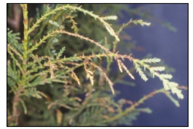
Fig. 3. Patchy necrosis of infected Leyland cypress twigs. Note the green tips of infect twigs - a common symptom of Cercosporidium blight.

Development of other foliar diseases of redcedar and Leyland cypress may resemble Cercosporidium blight (Ridings 1970). In landscapes, symptoms of Phomopsis blight of redcedar first appear on the tips of lower branches. In nursery settings, tip blight may occur at any level in the canopy. The pathogen, Phomopsis juniperivora Hahn, produces pycnidia on infected foliage and as conidia are exuded from these structures, tendrils of hyaline spores may be observed (McRitchie and Schubert 1985). Macroscopically, Phomopsis pycnidia and spore tendrils are easily differentiated from the greyish-brown tufts comprised of conidiophores and conidia produced by C. sequoiae . Pseudocercospora juniperi (Ellis and Everh.) Sutton and Hodges can cause a severe blight of Juniperus virginiana in the southeastern states, but seems to be less common