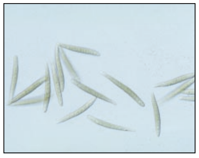
Fig. 1. Conidia produced by Cercosporidium sequoiae.