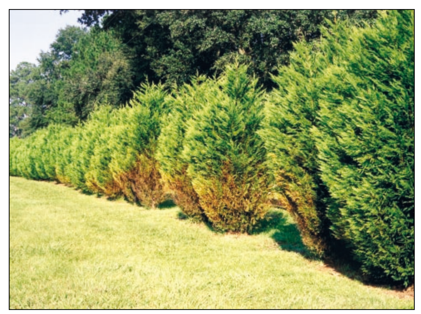
Fig. 4. Hedgerow of Leyland cypress exhibiting rusty brown necrosis of the lower canopy associated with Cercosporidium blight.

SURVEY AND DETECTION: Blighted needles on lower twigs and branches and a rusty brown necrosis throughout the lower canopy are suspect symptoms of Cercosporidium blight on older containerized plants or established landscape specimens. Young infected plants and cuttings may be completely blighted or killed. Using a handlens will help determine if a fungus is present on blighted tissue. Observing greyish-brown tufts of fungal mycelium may indicate the presence of Cercosporidium sequoiae .