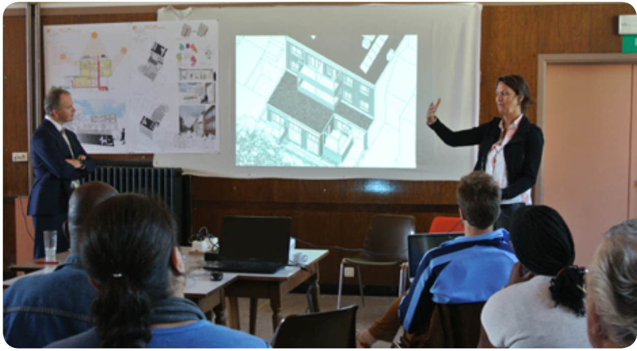
Presentation of the proposals from five architecture firms for the transformation of the first community land trust into seven low-energy households of the "Le Nid" project.

In view of the study's conclusions, the Brussels Regional Government decided to jump onto the CLT bandwagon. It agreed a certain num-