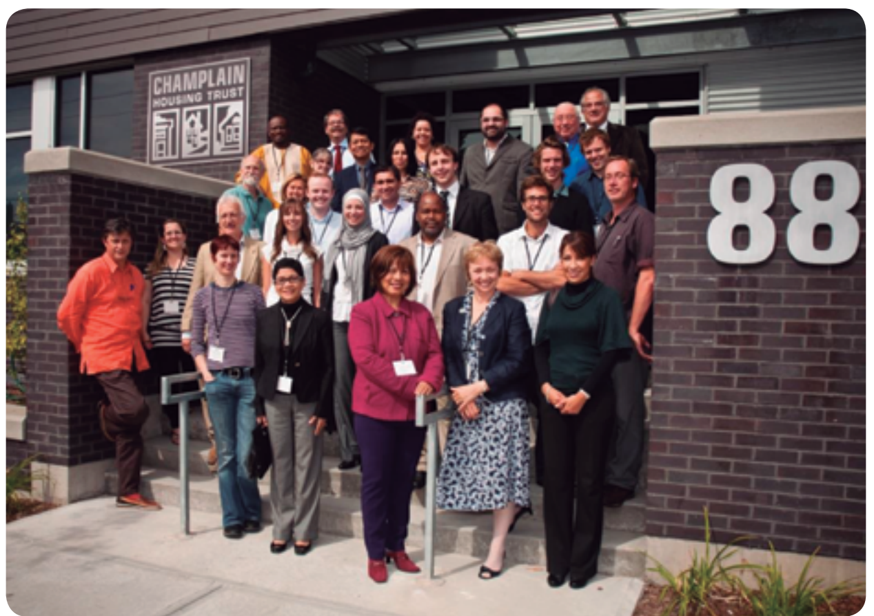
Visit of the international delegation of experts to the largest Community Land Trust, the "Champlain Housing Trust" (Burlington, Vermont, USA), after the latter had been granted the "Best Habitat Award" by the United Nations (September 2009).

by purchasing its first building in a Brussels municipality. Finally, when the Regional Parliament on Friday, 28 June 2013 adopted the amended Housing Code governing public-sector bodies in this sector, the existence of the Community Land Trust was given legal effect, alongside other forms of alternative housing such as intergenerational housing and solidarity-based housing.