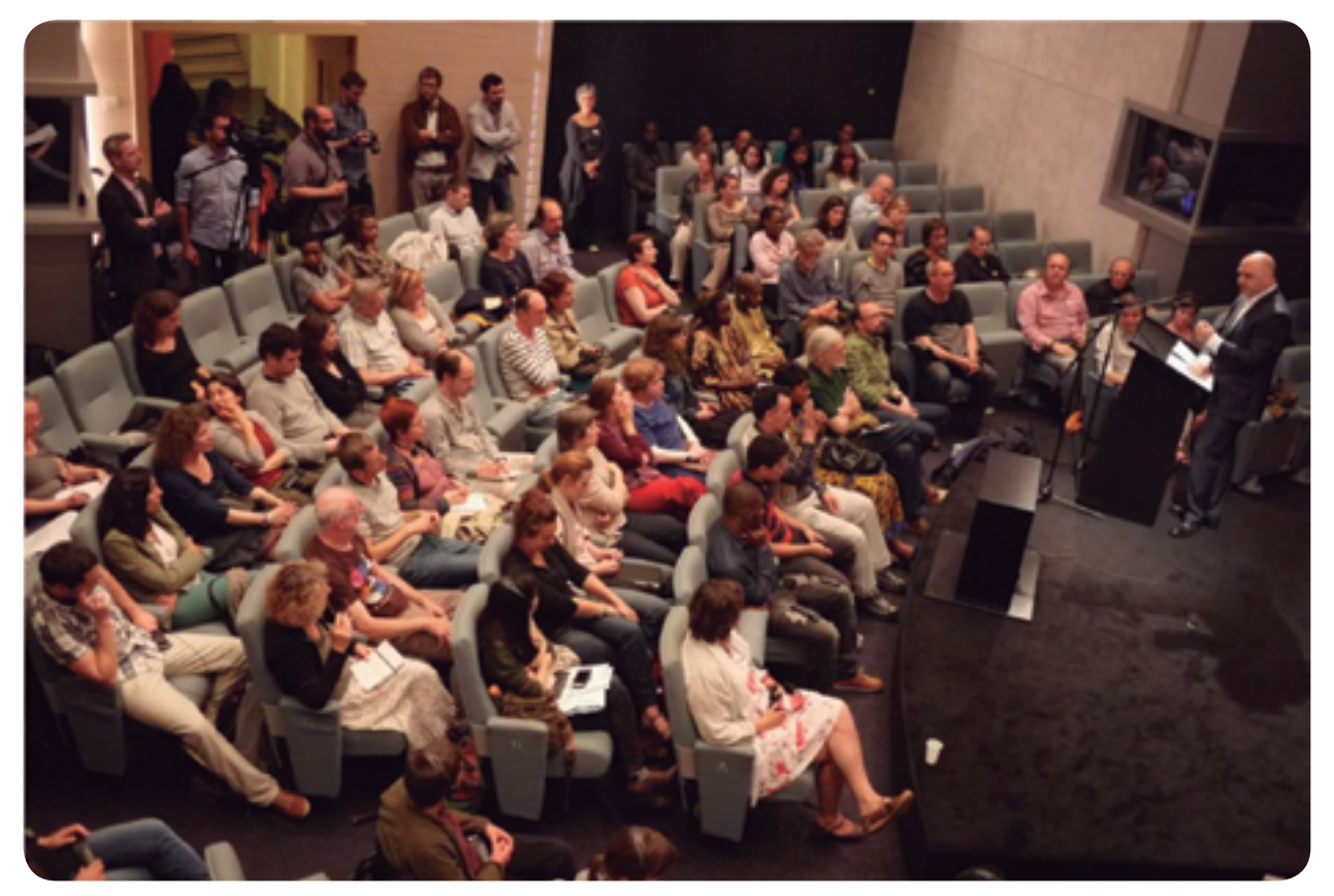
Speech by the former secretary of state for Housing of the Brussels Capital Region, during the international conference organised by CLTB: "Knowledge Building Across Community Land Trusts in Europe and the United States" (Brussels, 1st and 2nd of July 2013).

This process proved to be remarkably successful, with the L'Espoir project set up in Molenbeek in 2010, making it possible to house 14 low-income families. After 5 years, the social blueprint to erect this model building finally took form in the Rue Fin straat in Molenbeek-Saint-Jean. This innovative home ownership project undertaken by the Housing Fund combines ecology - it is an ecologically passive building - and socially cohesive housing.