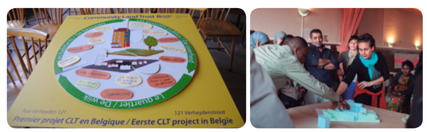
Exploratory architectural workshop in the framework of the 30 unit housing project "Arc-en-ciel", organised by CLTB with the future owners.

The other advantage pinpointed by the study and working in favour of a Community Land Trust being set up in the Brussels-Capital Region is the presence of a dynamic voluntary sector to support the establishment of this new model. Indeed, I have watched a number of grassroots associations develop innovative housing projects over the past few years. For example, I would cite the projects developed for squats, such as 123 Rue Royale, the socially responsible savings groups launched by CIRE and the Maison Biloba Huis community housing project for the elderly in Schaerbeek. While very diverse, what these initiatives have in common is a desire to look for new forms of urban homes and to enable people with limited incomes to gain access to decent housing at an affordable price while ensuring greater participation on the part of residents. Alongside these associations, there is rich network of organizations in the Brussels Region that are actively involved in helping those with low incomes to look for housing.