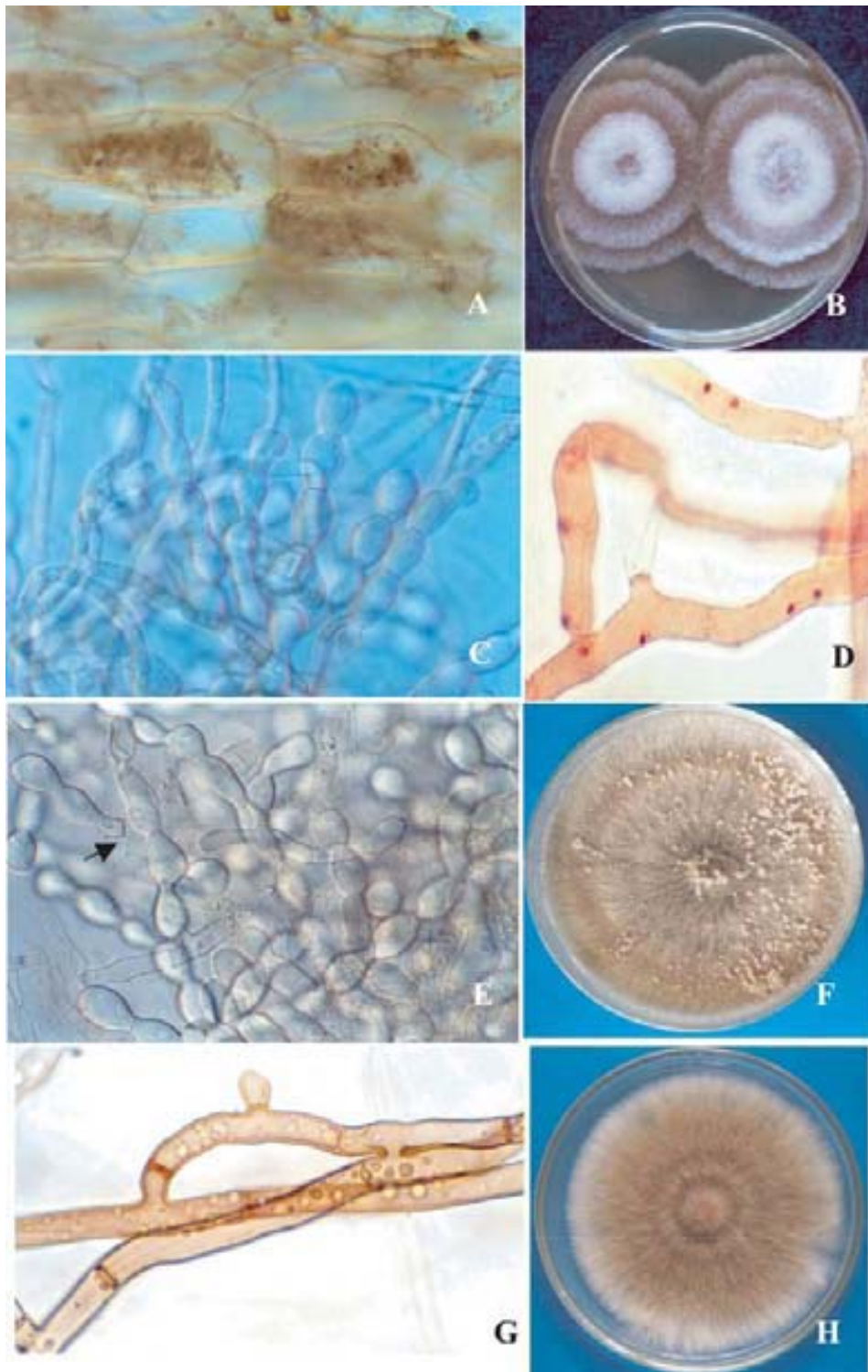
Figure 1 Ceratorhiza goodyerae repentis (KUFC 32-1): pelotons within root cortical cells 200X (A); colony on PDA, 7 days at 28°C, showing concentric zonation (B); barrel shape monilioid cells on PDA, 14 days at 28°C 400X (C); binucleate cells on V-8 agar, 3 days at 28°C 1,000X (D); Ceratorhiza pernacatena (KUFC 13-1): chain of monilioid cells with slight tubular constriction (arrowhead) 400X (E); colony on PDA, 14 days at 28°C (F); Ceratorhiza ramicola (KUFC 12-5): vegetative hyphae with oil globules 1,000X (G); colony on PDA, 5 days at 28°C (H).