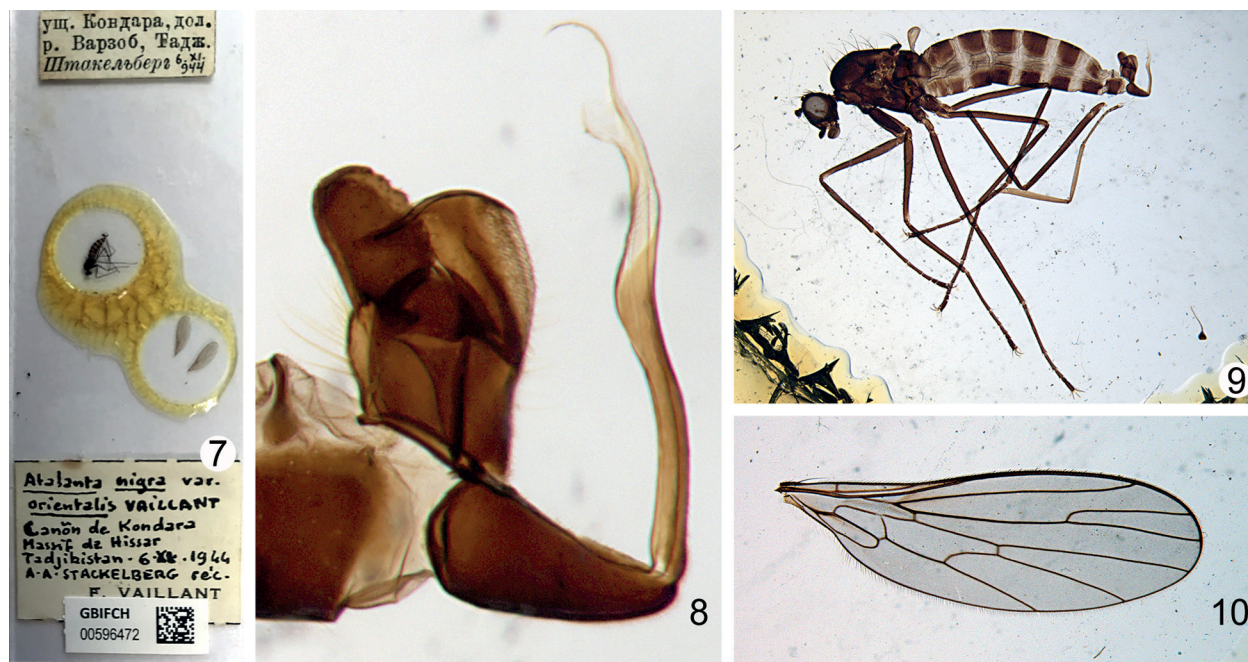
Figs 7–10. Clinocera orientalis (Vaillant) stat. rev., male paralectotype. 7. Slide. 8. Terminalia. 9. Habitus. 10. wing.