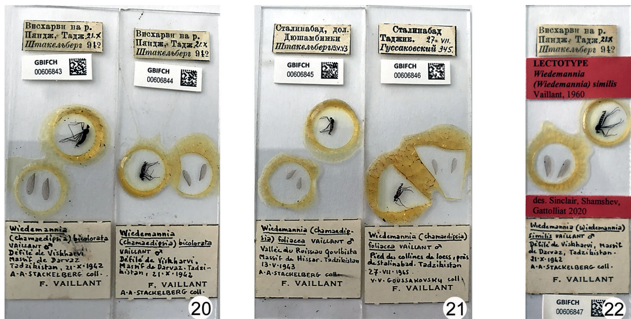
Figs 20–22. Specimens from Vaillant (1960b). 20. Wiedemannia bicolorata Vaillant, two paralectotype slides. 21. Wiedemannia foliacea Vaillant, two paralectotype slides. 22. Wiedemannia similis Vaillant, lectotype slide.

Material examined. Turkmenistan: Kara-kala [now Magtymguly], Syumy, viii.1931, P.A. Petristsheva (1 ♂, MZLS; Sinclair & Shamshev 2019, fig. 3), ix.1931 (2 ♂♂, ZIN (Sinclair & Shamshev 2019, figs 1, 2), 1 ♂, MZLS). Tajikistan: Stalinabad [=Dushanbe], valley of Gulbista River, 20.iv.1943, A.A. Stackelberg (1 ♂, ZIN; 1 ♂, on slide GBIFCH00606855, 1 ♀, MZLS); Stalinabad [=Du-