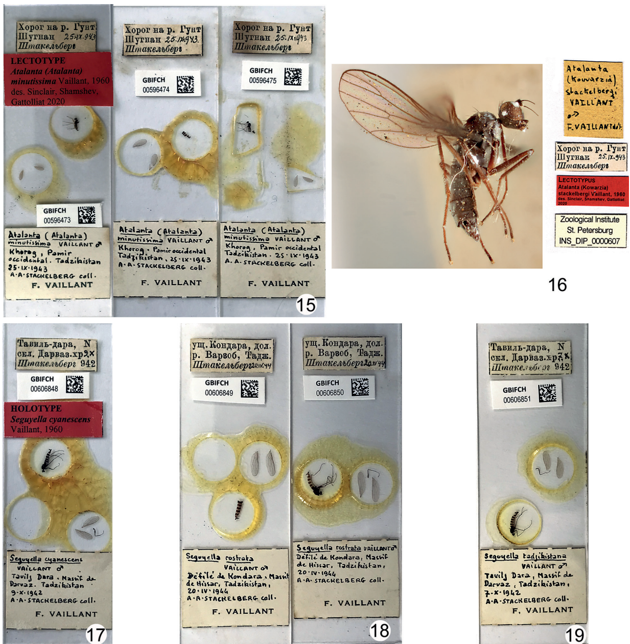
Figs 15–19. Specimens from Vaillant (1960b). 15. Clinocera minutissima (Vaillant), lectotype and two paralectotype slides. 16. Clinocera stackelbergi (Vaillant), lectotype and labels. 17. Seguyella cyanescens Vaillant (= Trichoclinocera cyanescens ), holotype slide. 18. Seguyella rostrata Vaillant (= Trichoclinocera rostrata ), two paralectotype slides. 19. Seguyella tadjikistana Vaillant (= Trichoclinocera tadjikistana ), paralectotype slide.

Trichoclinocera rostrata (Vaillant): Sinclair, 1994: 1016 (new combination).