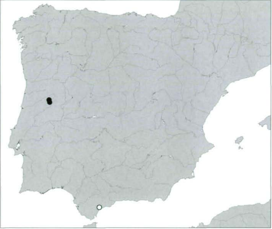
Map 1: Distributions of Phloeocharis estrelae sp. n. (filled circles) and P. bermejae sp. n. (open circle).