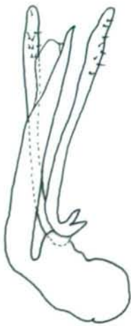
Figs 1-4: Phloeocharis mallorcina sp.n.: 1 – habitus; 2-4 – aedeagus in lateral and in ventral view. Scale bar: 1: 1.0 mm ; 2-4: 0.4 mm.