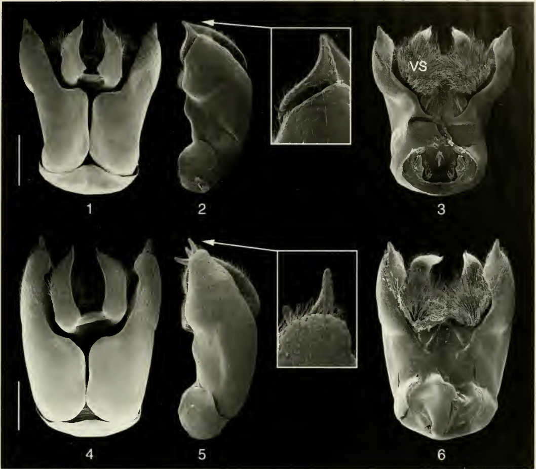
Figs 1-6. Male genitalia; left: dorsal view, middle: lateral view, window: detail of apical region of gonocoxite showing gonostylus, right: ventral view. 1-3, R. nigripes FRIESE; 4-6, R. schoenitzeri sp. n. VS: volsella. Scale bar: 250 \mu m.

developed, Figs 7, 9); dorsal tooth-like projections of BPAS 7 long, Figs 10, 11 (short, Figs 7, 8); APAS 7 basally with long tooth-like projection on ventral side, Fig. 11 (tooth-like projection short, strongly reduced, Fig. 8); gonocoxite long, at least 2.5 times as long as broad in lateral view, Fig. 5 (truncate, only 2 times as long as broad, Fig. 2); apical part of gonocoxite hardly diverging, longer (1.3 times) than broad in lateral view, with dense punctation, Figs 4-6 (considerably diverging, as long as broad, with dispersed punctation, Figs 1-3); GS strongly truncate, only tooth-like apical part protruding gonocoxite in lateral view, Fig. 5 (GS distinctly protruding gonocoxite in lateral view, Fig. 2).