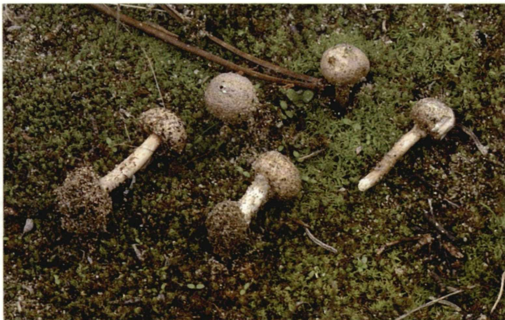
Fig. 2. Tulostoma lesiei , fruitbodies from Ravenna, Italy.