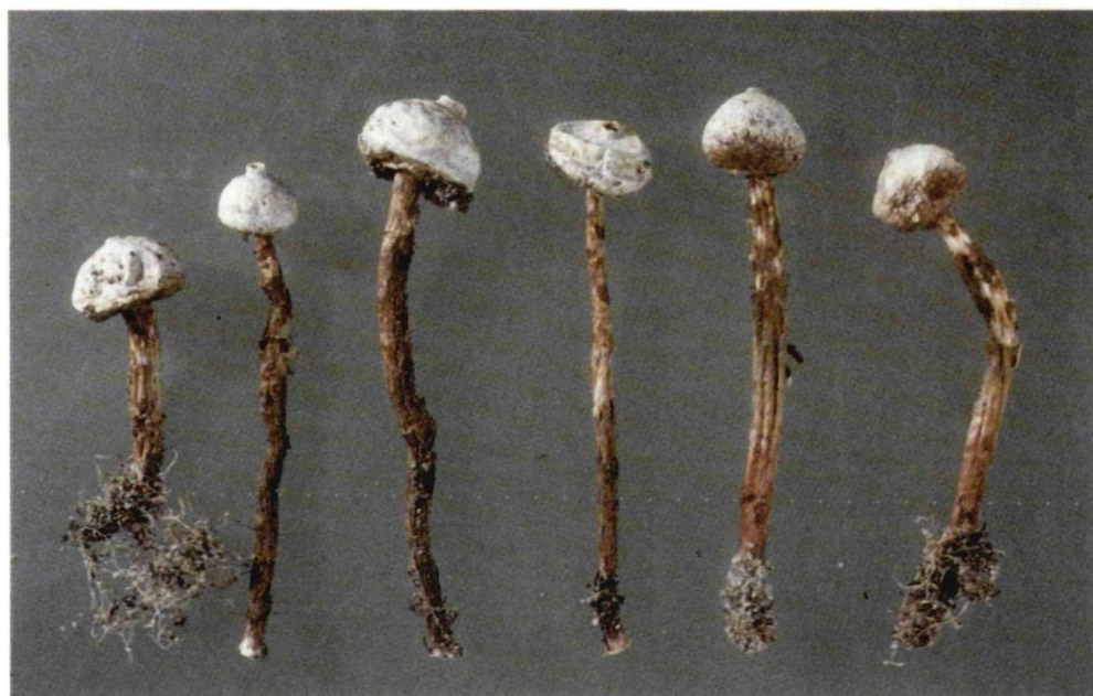
Fig. 3. Tulostoma squamosum , fruitbodies from Ravenna, Italy.