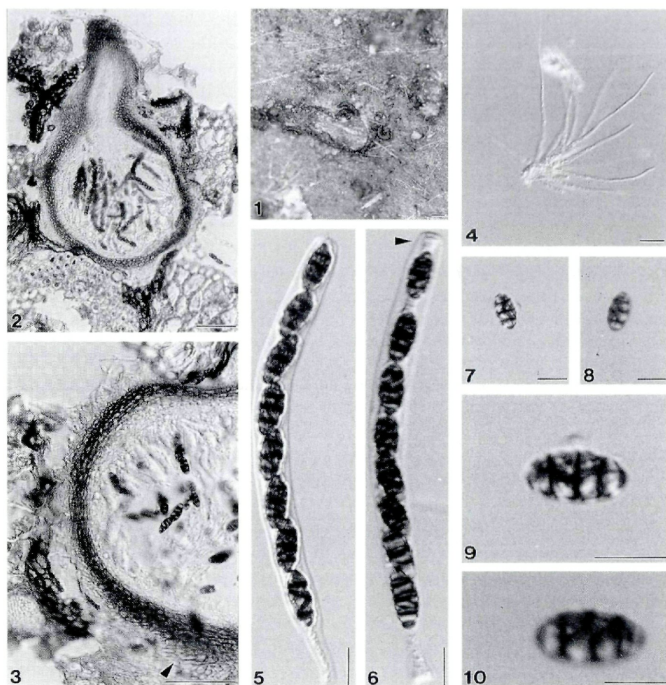
Figs. 1-10. - Thyridium chrysomallum . - 1. Appearance of ascomata on host surface. - 2, 3. Vertical sections through ascomata showing periphysate ostiole with a long neck, and arrangement of peridium cells. - 4. Paraphyses. - 5, 6. Asci showing refractive apical apparatus (arrowed). - 7-10. Ascospores, pale brown showing thickened pigmented walls. Bars: 1 = 500 \mu m; 2, 3 = 50 \mu m - 4 = 20 \mu m - 5-10 = 10 \mu m.

Habitat. - Saprobic on A. alexandrae rachids.